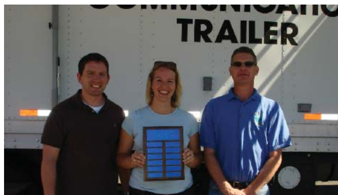
1st Place Agency - Ecology