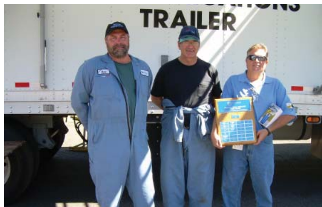
1st Place Winners - Pacific Terminal Services

Winners received a commemorative rodeo belt buckle and Visa gift cards. This years winners were Pacific Terminal Services, 1st Place; NuStar Terminals (Portland), 2nd Place; and Tesoro Refining and Marketing, 3rd Place. ECY placed as the winning Agency.